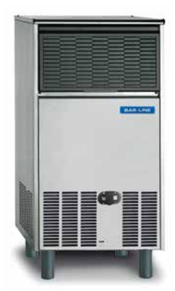
B 7540 AS/WS

Bar Line Equipment range is the newly released EU made ice makers for Thimble-shaped rounded ice cubes coming from Bar Line.